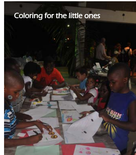
Coloring for the little ones