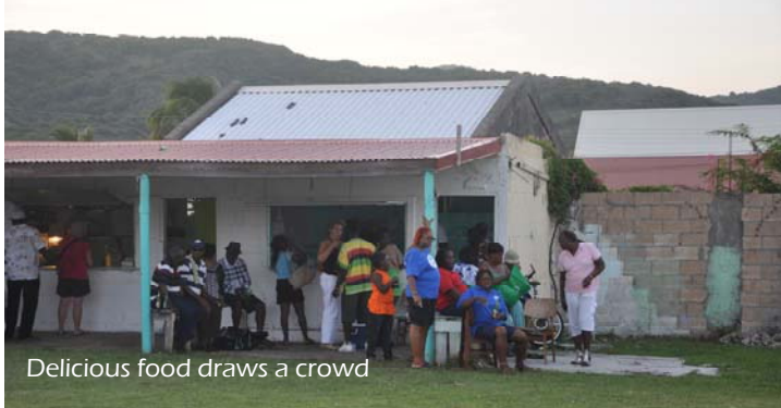
Delicious food draws a crowd