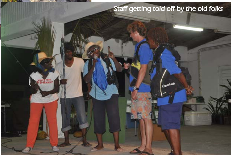
Staff getting told off by the old folks